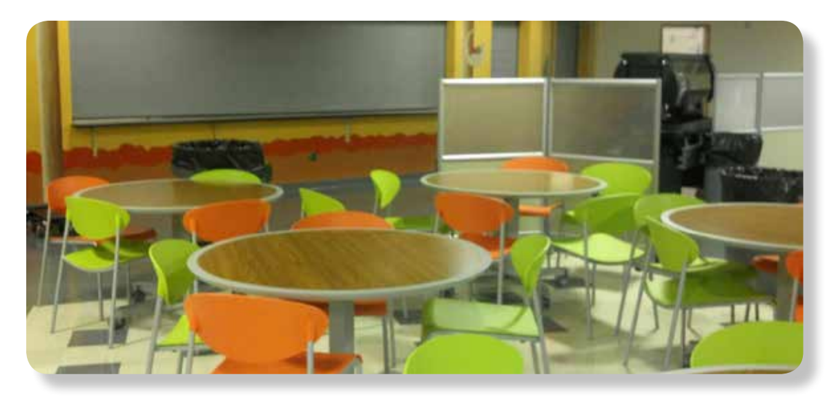
Adams City High School's new cafeteria.

Visit the virtual lunch box online for strategies school and district leaders can use to create healthier meals for students and staff that are grown locally and prepared from scratch.