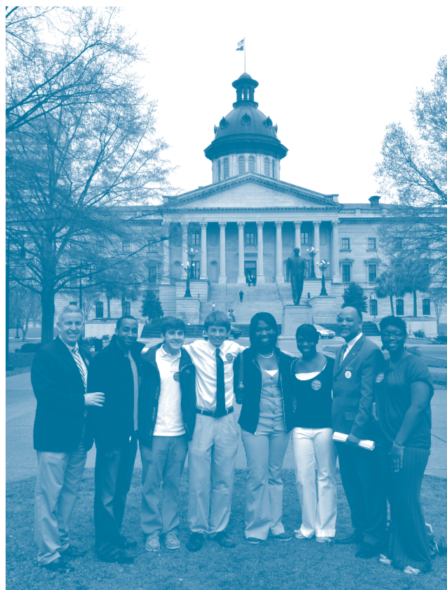
Youth from Rage Against the Haze gather at a Kick Butts Day event at South Carolina's State Capitol