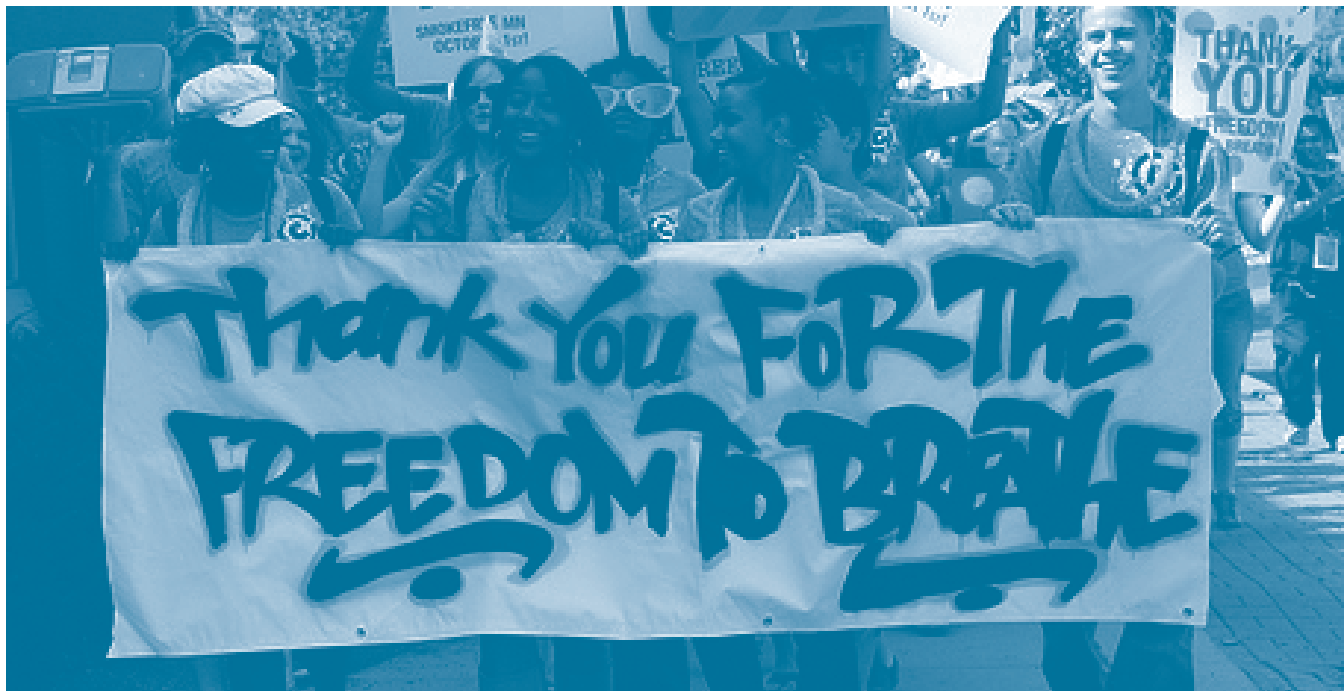
Minnesota youth hold 'Freedom to Breathe' march in St. Paul to thank legislators for passing a clean indoor air policy

Engagement of youth in tobacco control involves providing the opportunity for young people to gain the ability and authority to make decisions that help improve the policy environment, change social norms, and reduce smoking initiation and consumption in their communities.