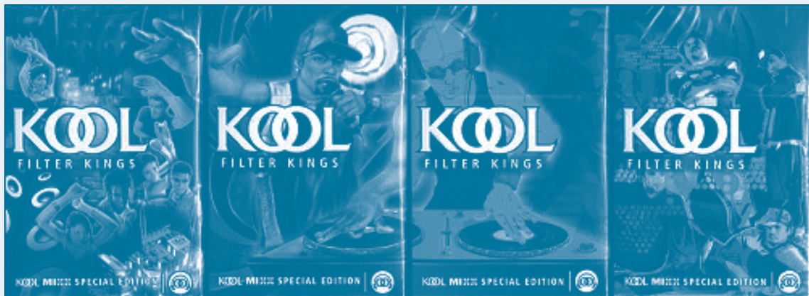
Kool Mixx packaging

Outraged by this direct targeting, young people joined forces with the National African American Tobacco Prevention Network to launch Operation Storefront. 67 As part of this project, youth spoke out against this target promotion and asked their state Attorneys General to file a complaint. As a result of their efforts, in 2004, state Attorneys General from Maryland, New York, and Illinois filed lawsuits against Brown & Williamson. The company was forced to shut down the Kool Mixx website and destroy 79,000 cartons of the special edition cigarette packages still in stores. 68